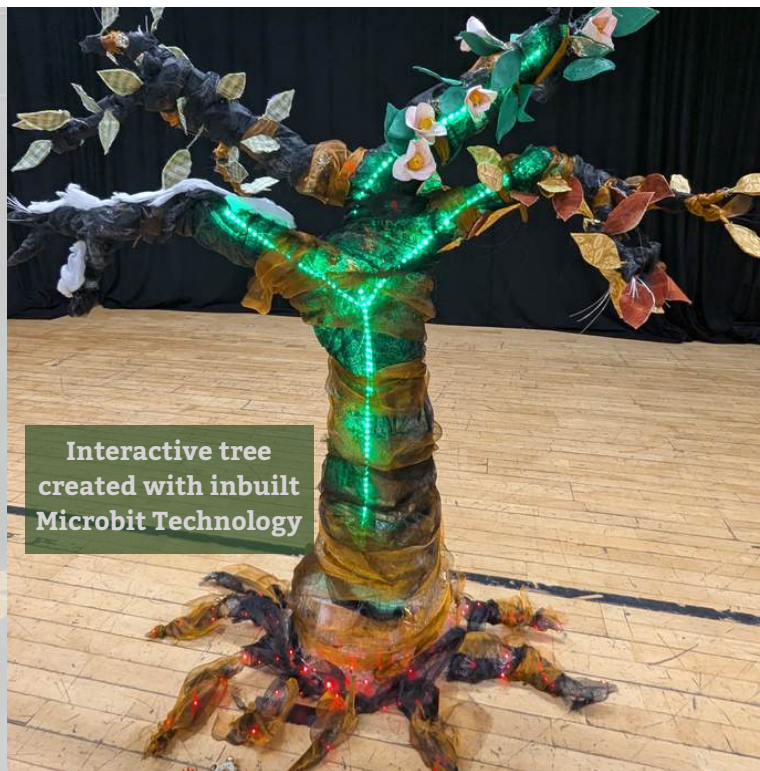
Interactive tree created with inbuilt Microbit Technology

What do you see when you look at a tree?