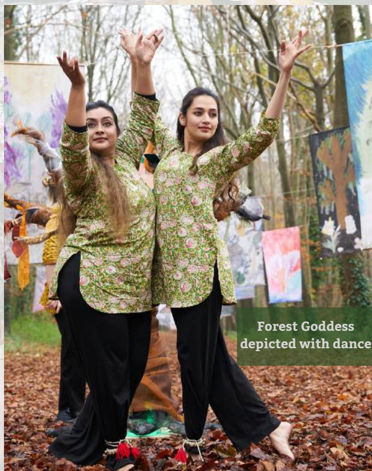
Forest Goddess depicted with dance

Drawing inspiration from Buddha attaining enlightenment under a Bodhi (fig) tree in India and Newton discovering gravity from an apple tree in the UK, Tree of Life weaves a tale of how these two events lead to a deepening of human understanding of our natural world, spiritually and scientifically.